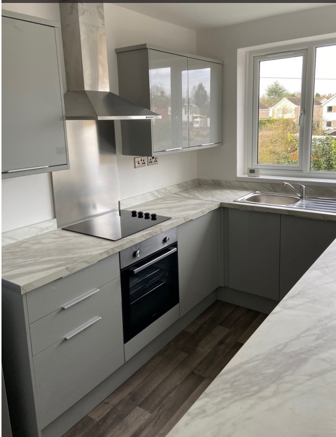
F RE-MODELLED KITCHEN